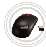
ThinkPad® Optical Wireless Mouse Mouse for All