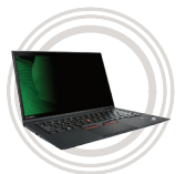
3M Privacy Filters from Lenovo™ Privacy Protection & Anti-Glare