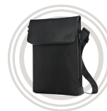
ThinkPad® Ultra Messenger Function, Protection & Comfort