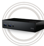
ThinkPad® USB 3.0 Ultra Dock Universal Docking Solution