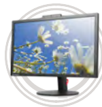
ThinkVision™ T-series Multimedia, Full-Series