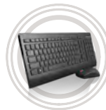
Lenovo™ Ultralim Wireless Keyboard and Mouse Combo Fast & Fluid