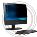
3M Monitor Privacy Filter Privacy Protection & Anti-Glare