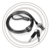
Lenovo™ Kensington® MicroSaver® DS Cable Lock Reduce Thieves, Easy to Install