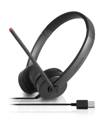
Lenovo Stereo Headset (4XD0K25031)

Crystal clear conversations with an adjustable 180° boom microphone that fits comfortably.