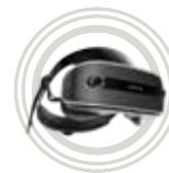
Lenovo Explorer Immersive Headset