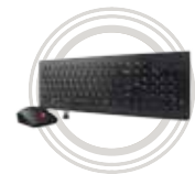
Lenovo 510 Wireless Combo Keyboard & Mouse

* Example of Lenovo IdeaCentre AIO catalogue naming convention