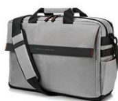
HP 15.6 Trend Topload Case L6V62AA