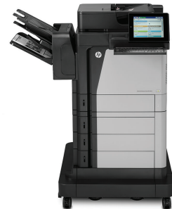
HP LaserJet Enterprise Flow MFP M630z