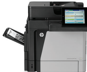
HP LaserJet Enterprise MFP M630dn

Rely on a full-featured HP Enterprise Flow MFP that streamlines digital workflow with advanced HP Flow solutions, safeguards business data and documents with a robust suite of top-flight security features and offers simple, efficient mobile printing.