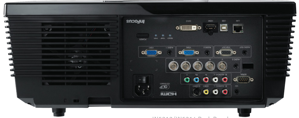
IN5312/IN5314 Back Panel

The 4000 lumens of the IN5314, IN5316HD and IN5318 display crisp, detailed images even in bright rooms. But if even more brightness is needed, you can bump it up to 4500 lumens with the IN5312. Plus, their single-lamp design makes it economical and easy to maintain.