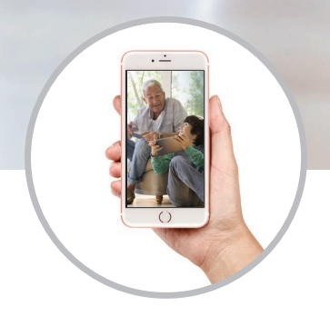
Easily print from your smartphone or tablet<sup>1</sup>